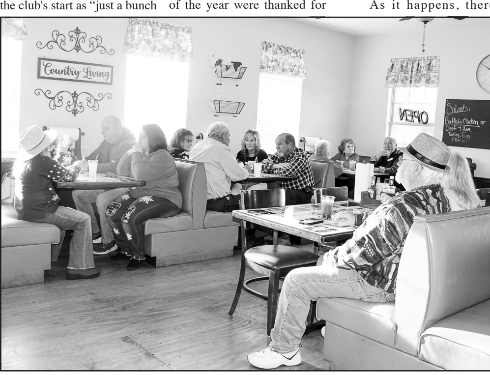
The Blairsville Cruisers broke bread and gave gifts in their 2023 Christmas Dinner, celebrating being together one last time until the next Cruise-In season starts up in April 2024.

In all, the Cruisers went home with full bellies and even fuller hearts, looking forward to doing the same charitable work next year.