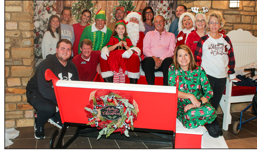
Union County Parks & Rec hosted a very festive Classic Christmas over the weekend.

a friendly calf. People of all ages enjoyed apple cider and hot cocoa courtesy of the Fellowship of Christian Athletes.