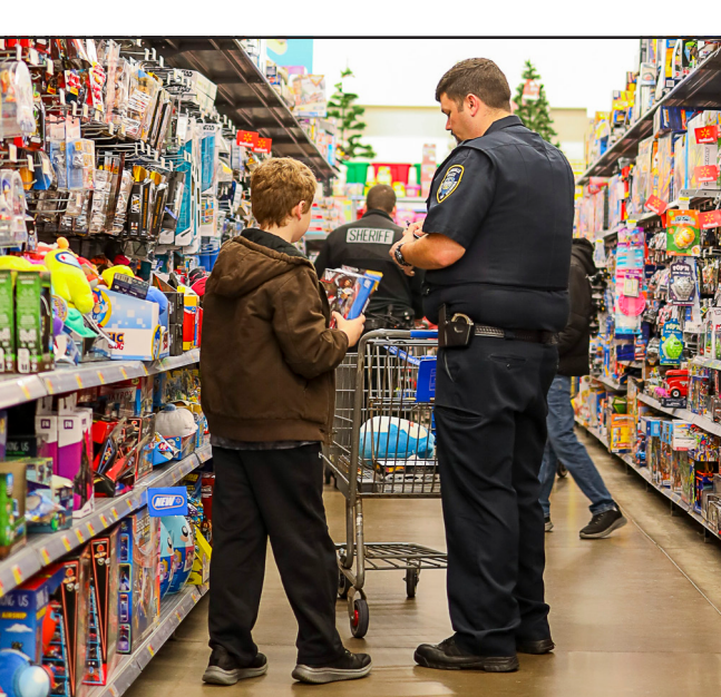
'Our church has been For the Blairsville Police Department, Shop With a Cop for involved with it for several Christmas is the most wonderful time of the year.