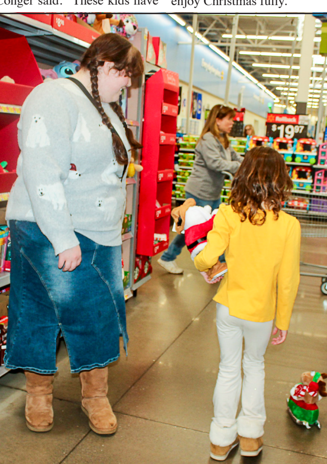
Part of the fun of chaperoning during a volunteer Christmas their new friend zipped around shop is watching the children interact with all the toys.

The Beta Club, Key Club, 4-H, Interact Club and DECA teamed up to wrap presents and set out Christmas-themed activities for the kids after shopping, making doubly sure the holiday season is merry and bright for little ones who may not otherwise have a chance to enjoy Christmas fully.