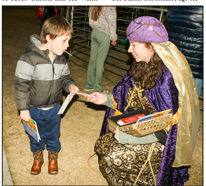
Christmas gifts. A wisewoman from the live Nativity at the "Classic Christmas" and gave the first handing out another candy cane to a little guy on Friday. A wisewoman from the live Nativity at the "Classic Christmas"

For the last 30 minutes of the first night, the chorus moved we could have a relationship inside to perform in a warmer venue while kids and adults up. "Know that most of all, alike rode a donkey, posed for pictures with a goat, and petted