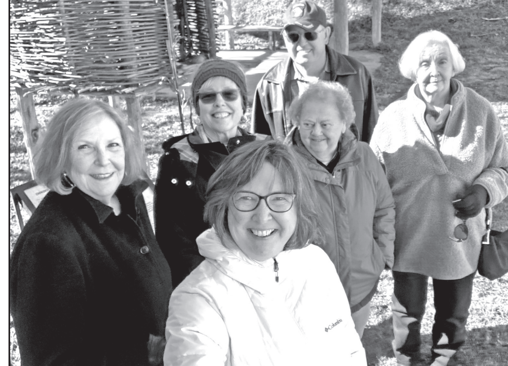
Old Unicoi Trail Daughters & Guests